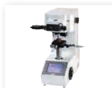
Microtech MX 1