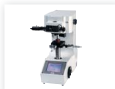
Microtech MX 1